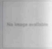
Gregory Ain Exhibition House for the c.1950